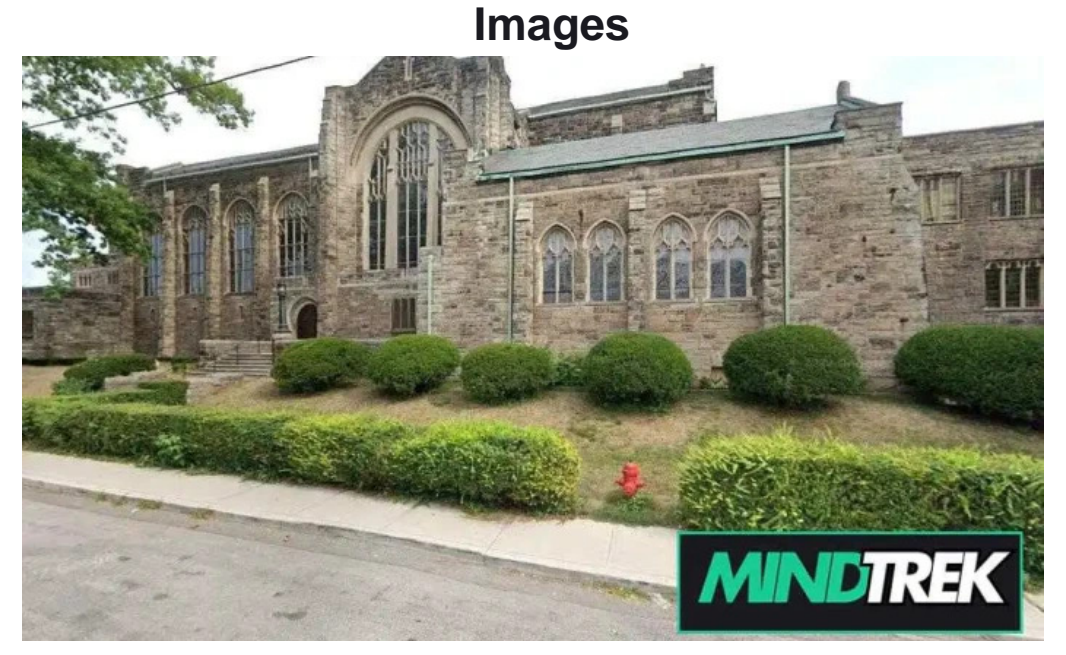
Peaceful pathways counselling hamilton

In case you want to adjust any information that you think is not correct related to this portal, we ask send us a message and we will fix it as soon as possible. With anticipation we appreciate it.