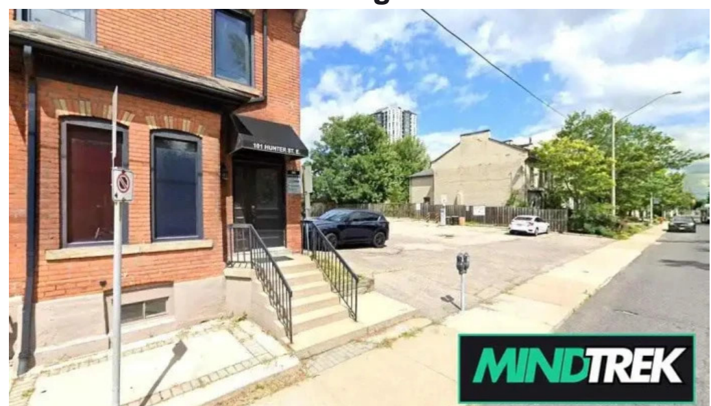
Psychology group hamilton hamilton