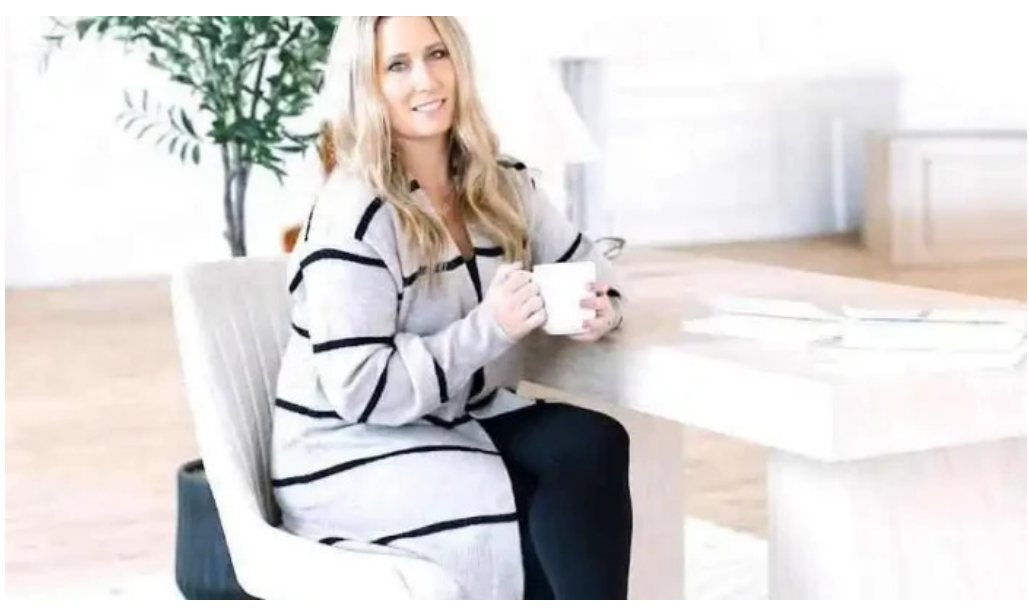
Re mind mental health services hamilton