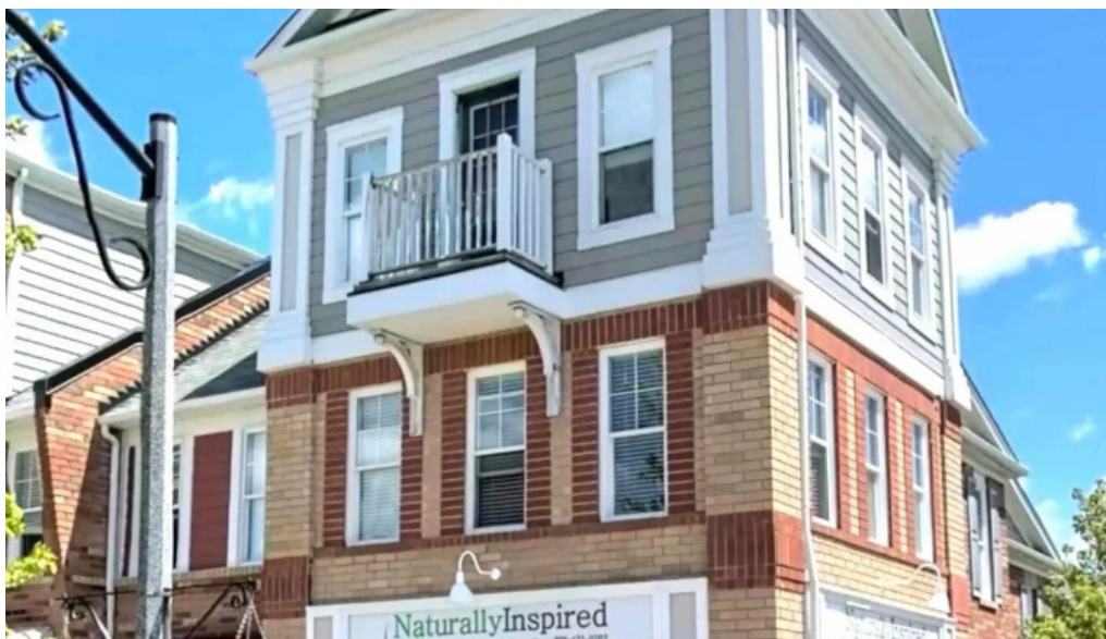
Blue wave therapy markham