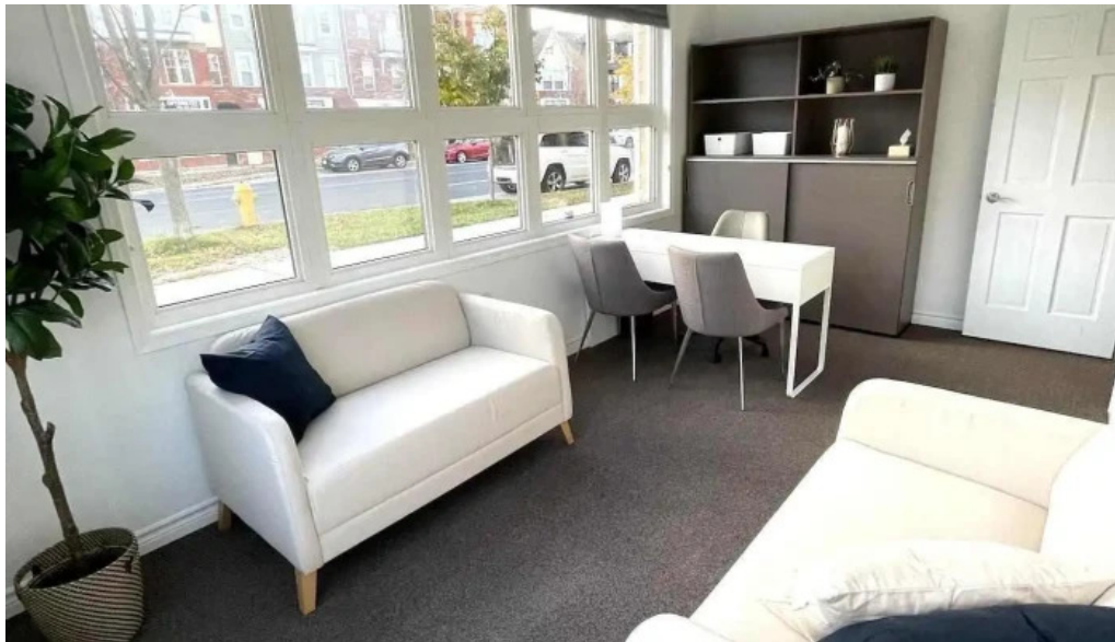
Blue wave therapy by owner