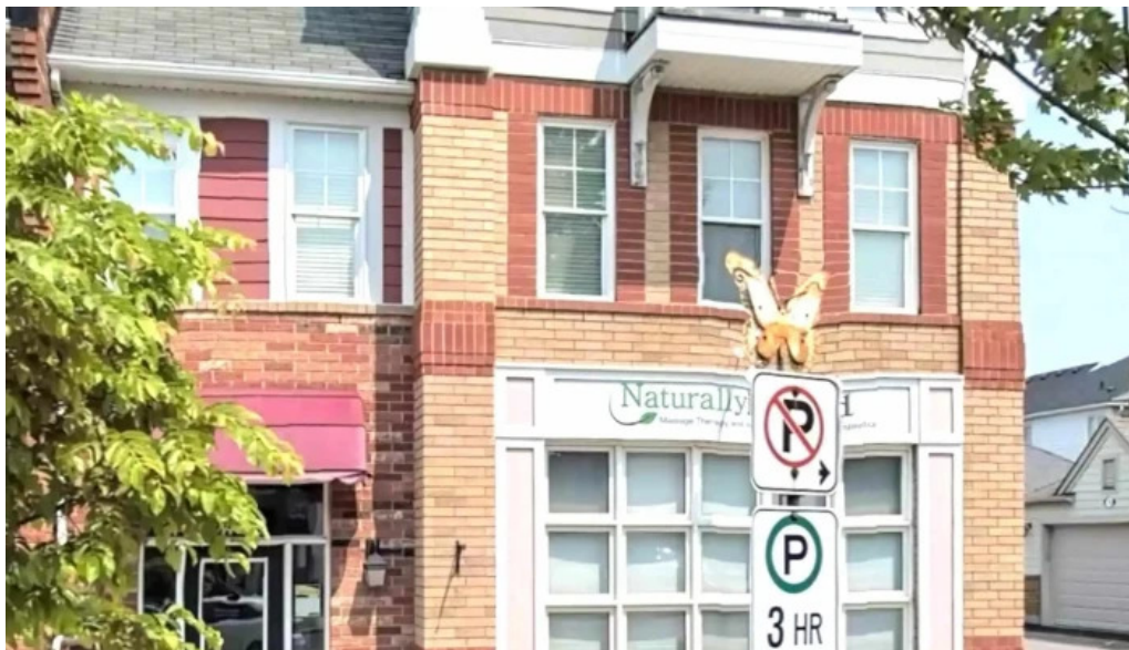
Blue wave therapy photos