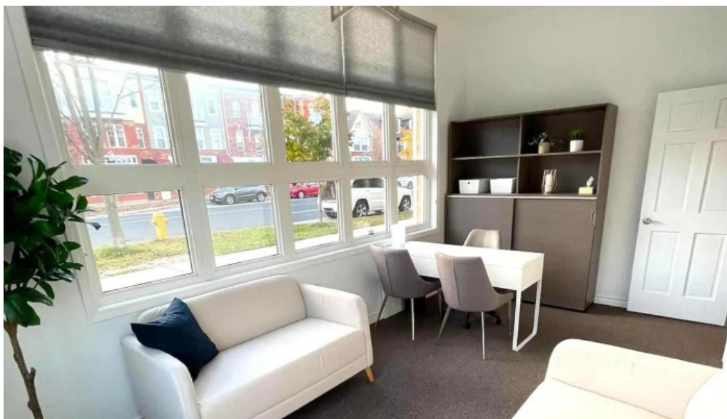
Blue wave therapy mental health service