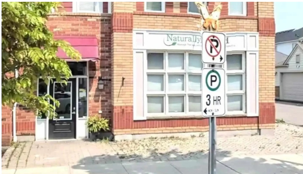
Blue wave therapy all