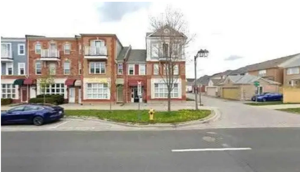
Blue wave therapy street view 360deg