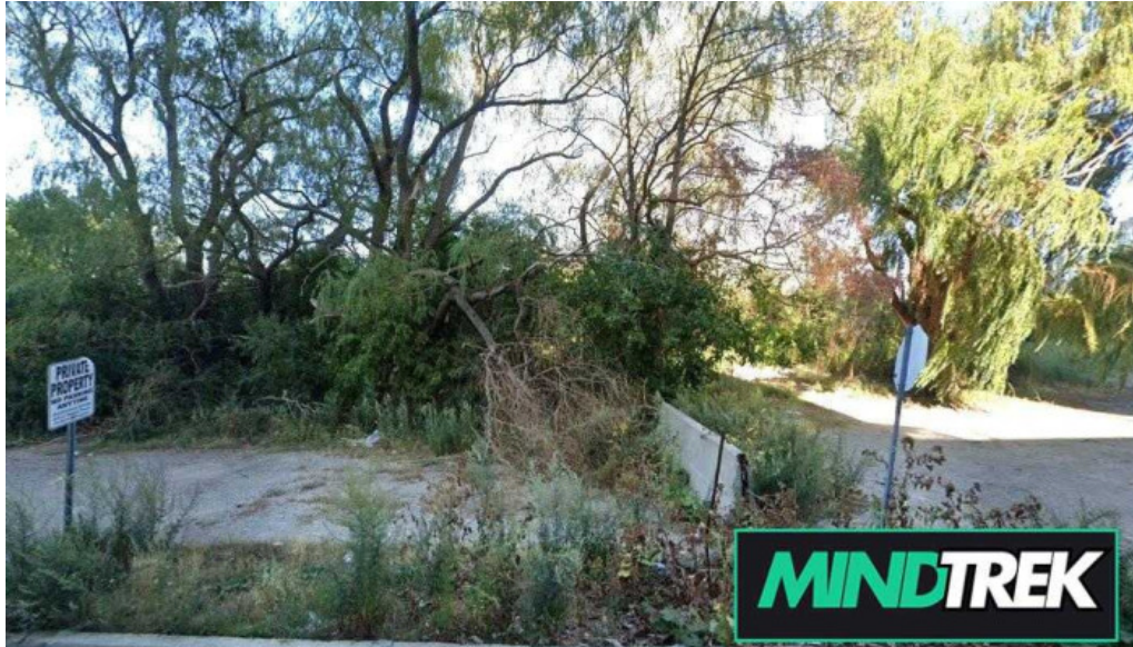
Core centre inc psychological services mississauga