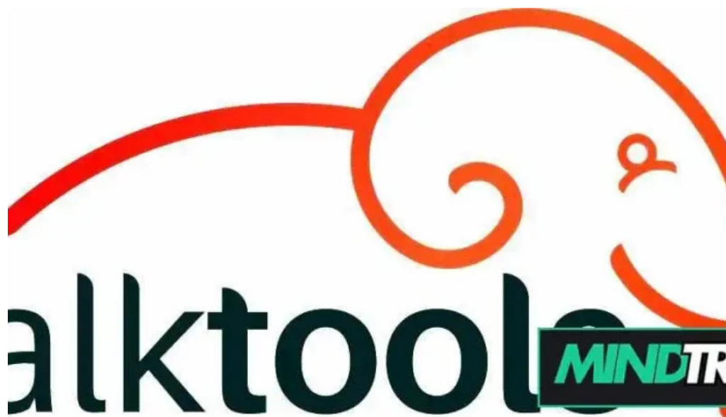
Talk tools psychotherapy by owner