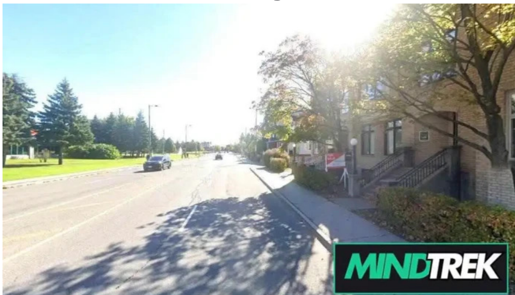
Talk tools psychotherapy nepean