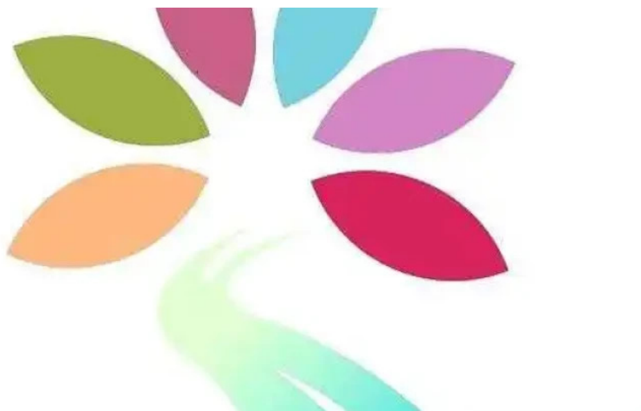
Upstream ottawa mental health community support by owner