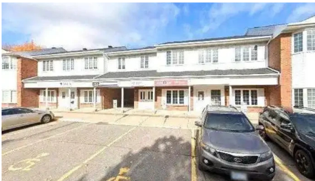
Upstream ottawa mental health community support all