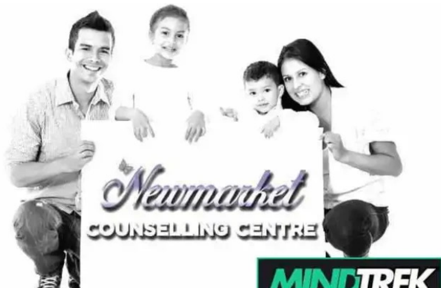
Newmarket counselling centre newmarket