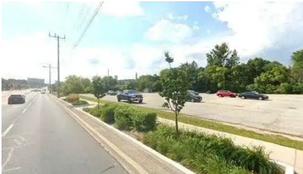
Newmarket counselling centre street view 360deg