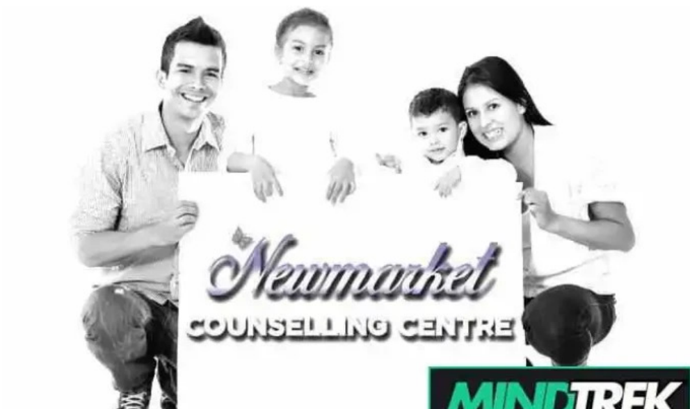
Newmarket counselling centre all