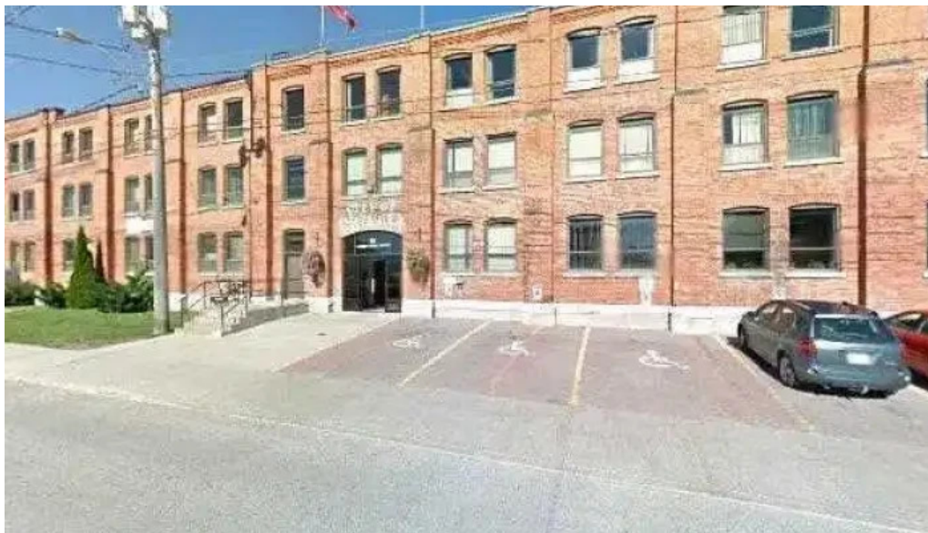
Birchwell psychotherapy counselling all