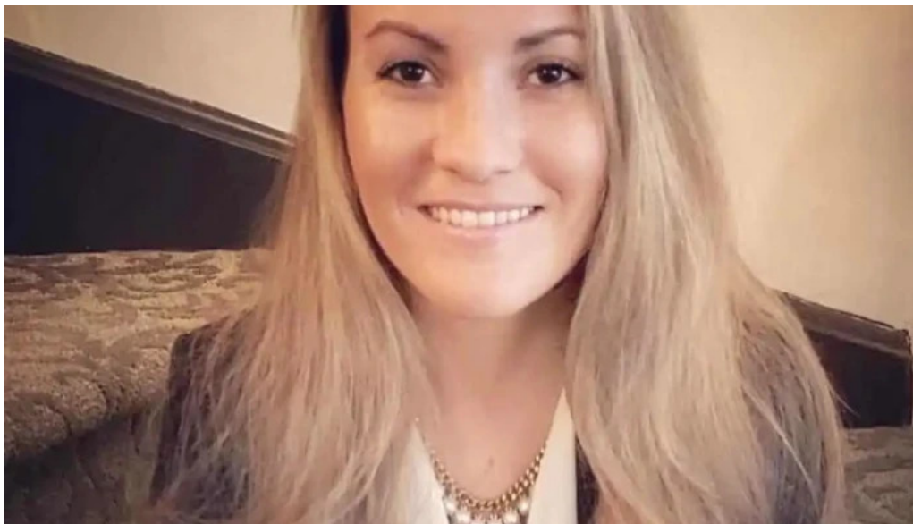
I blume therapy by owner