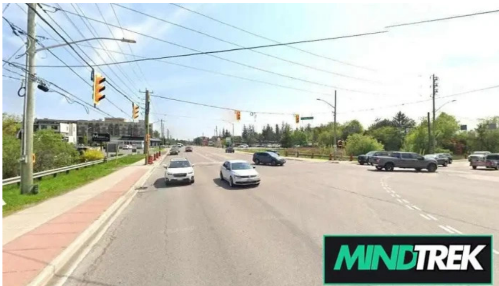
I blume therapy richmond hill