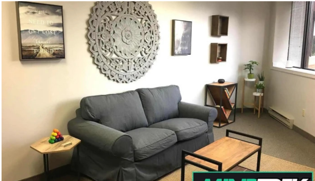
A little zen counselling and psychotherapy by owner