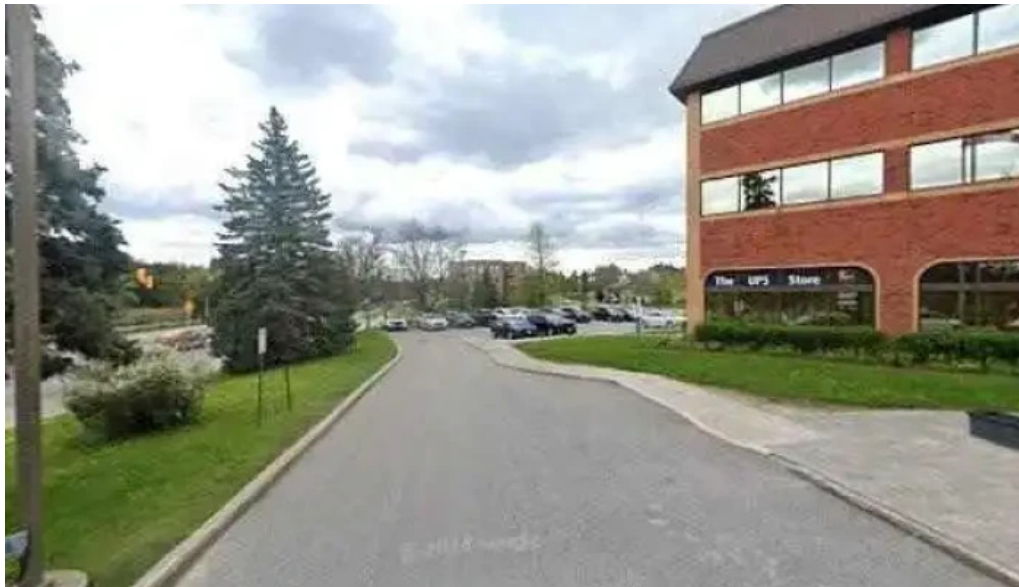
A little zen counselling and psychotherapy street view 360deg