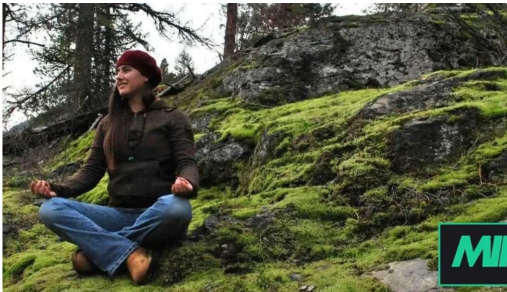
A little zen counselling and psychotherapy uxbridge