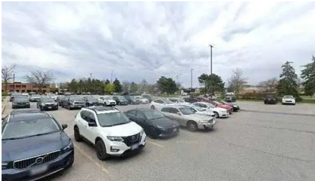
Dawn bernard counselling psychotherapy street view 360deg