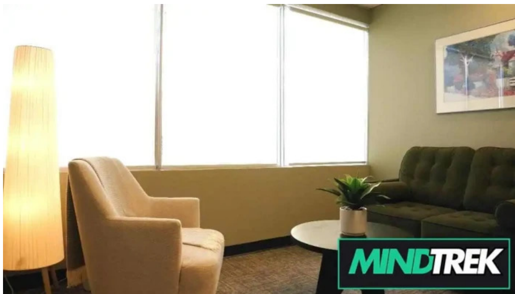
The green couch psychotherapy by owner