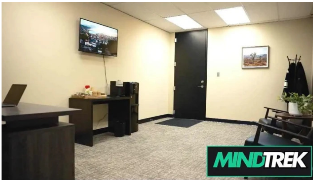
The green couch psychotherapy whitchurch stouffville