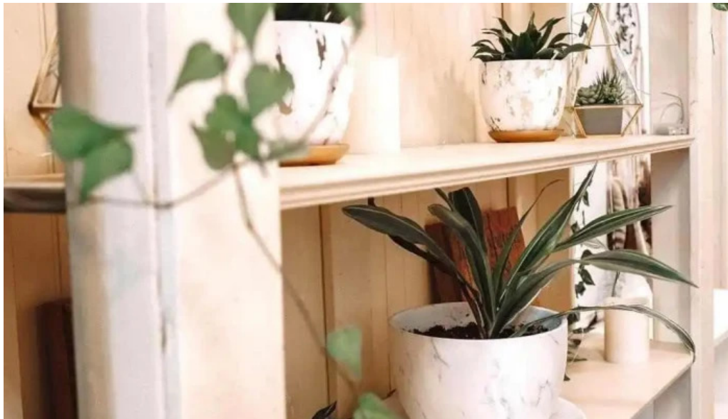
Renewed health wellness by owner