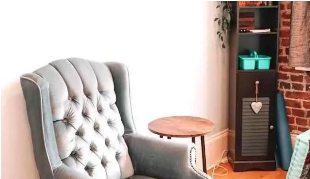
Renewed health wellness orillia