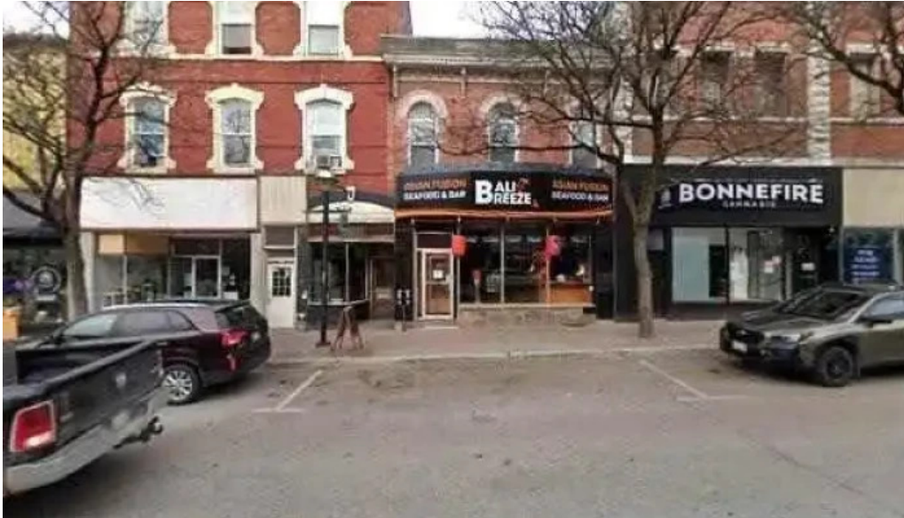
Renewed health wellness street view 360deg