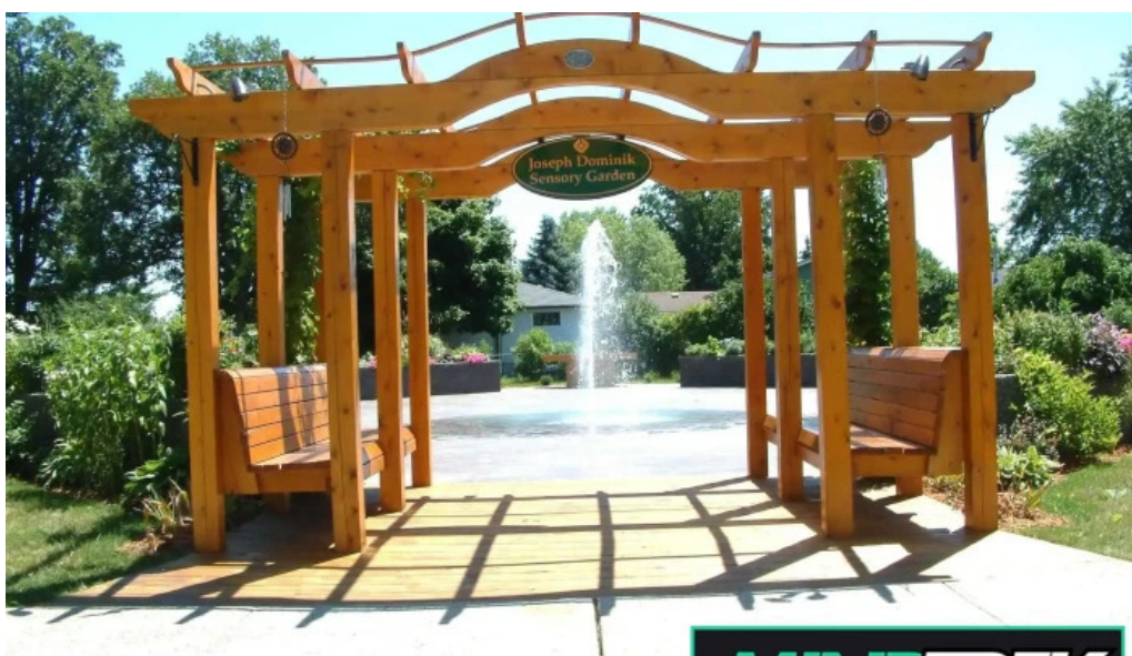
Ongwanada resource centre by owner