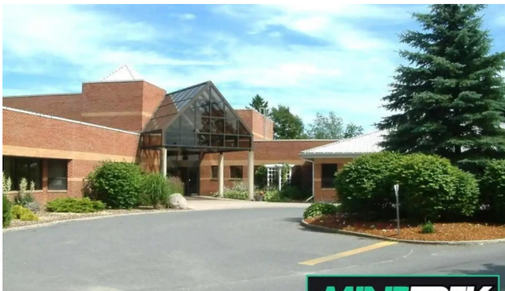
Ongwanada resource centre kingston