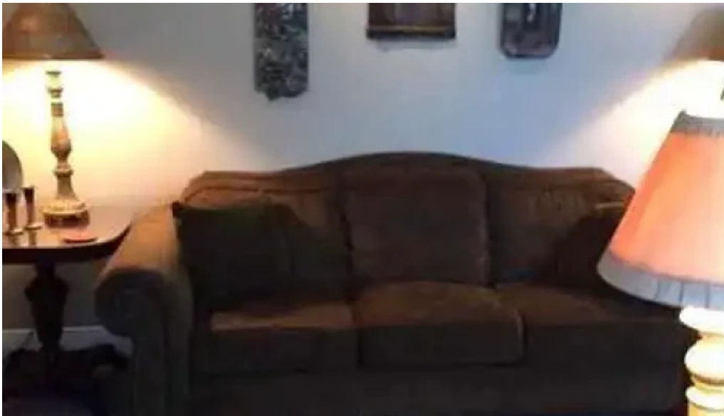
Wanda nayduk barrie therapist and mental healthcare professional all