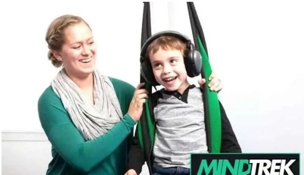
Achieve therapy centre speech and occupational therapy for kids by owner