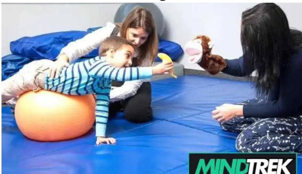
Achieve therapy centre speech and occupational therapy for kids ottawa