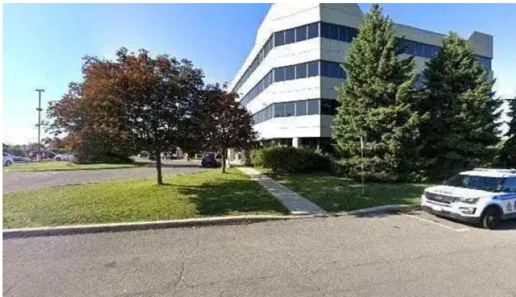
Achieve therapy centre speech and occupational therapy for kids street view 360deg