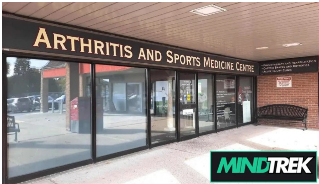
Arthritis sports medicine centre asmc cbi health ancaster