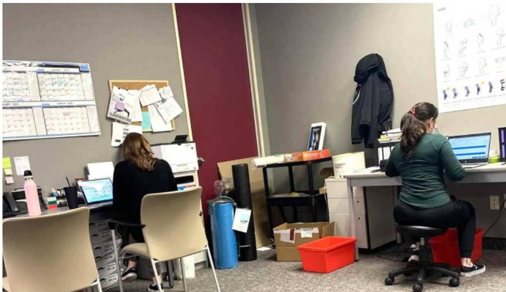
Arthritis sports medicine centre asmc cbi health ancaster