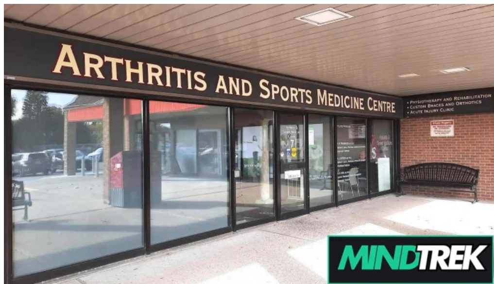
Arthritis sports medicine centre asmc cbi health all