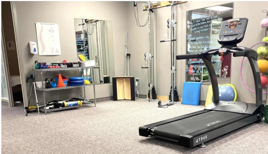
Arthritis sports medicine centre asmc cbi health physical therapist