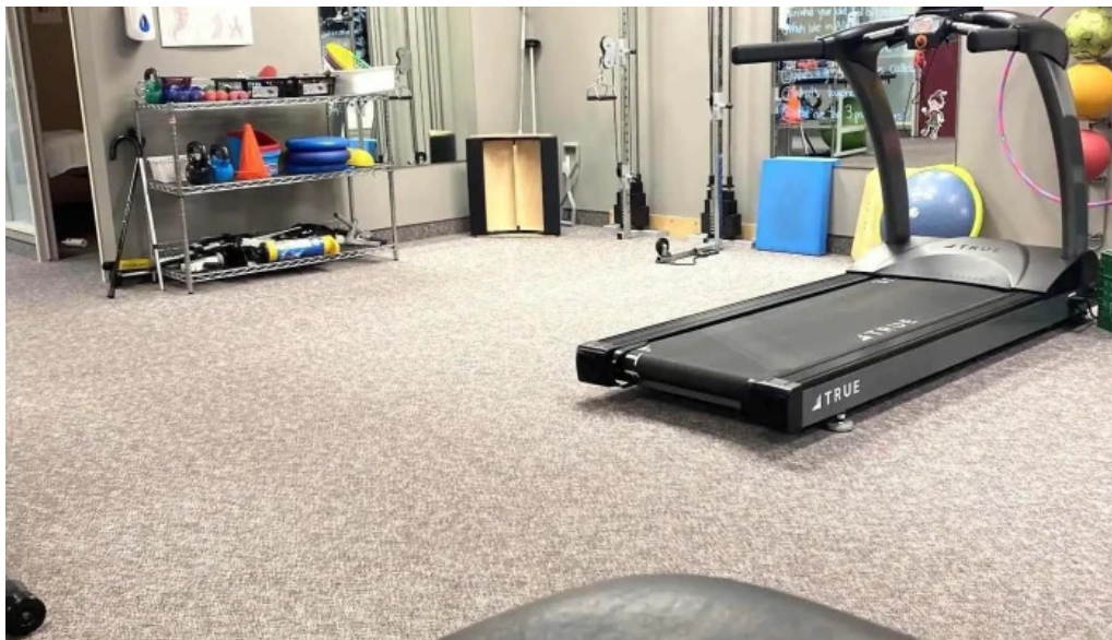
Arthritis sports medicine centre asmc cbi health physical fitness