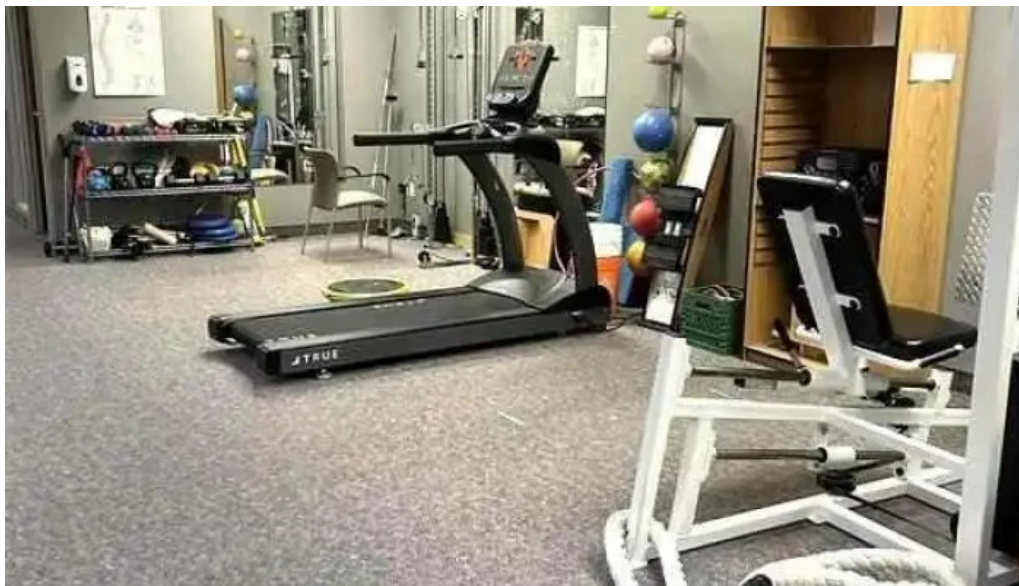
Arthritis sports medicine centre asmc cbi health latest