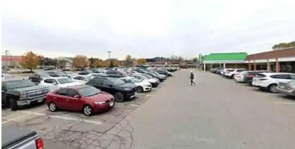
Arthritis sports medicine centre asmc cbi health street view 360deg