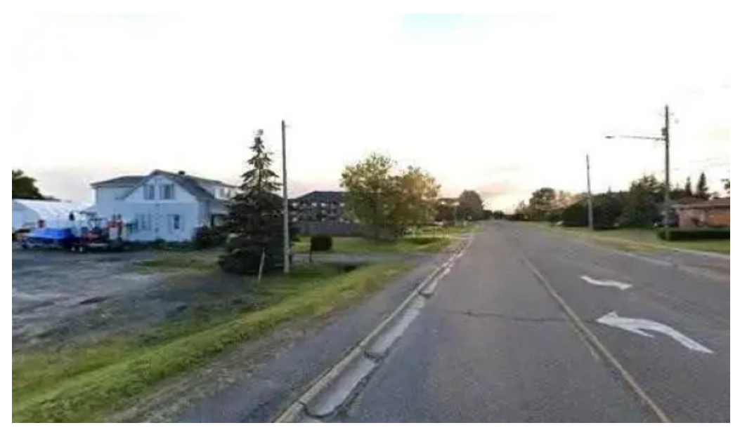
Movephysiotherapy street view 360deg