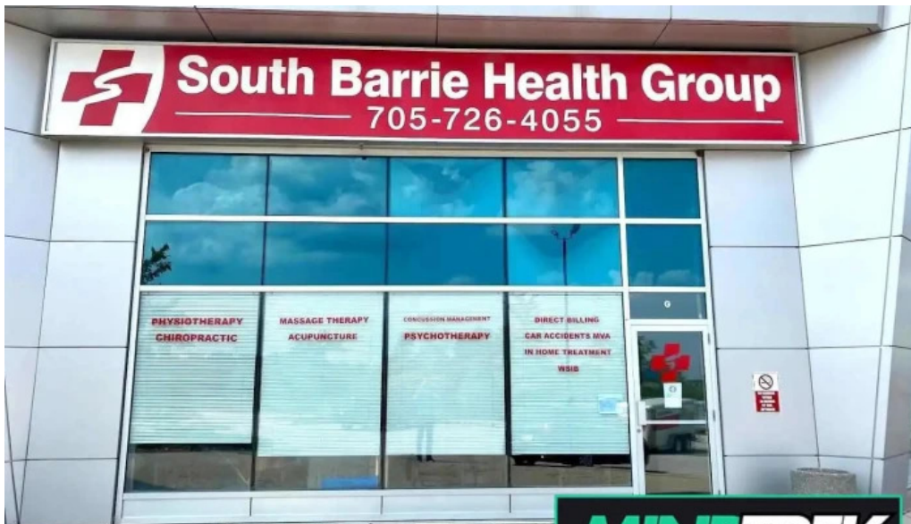
South barrie health group barrie