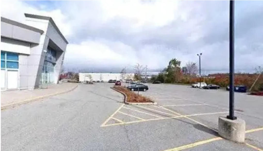
South barrie health group street view 360deg