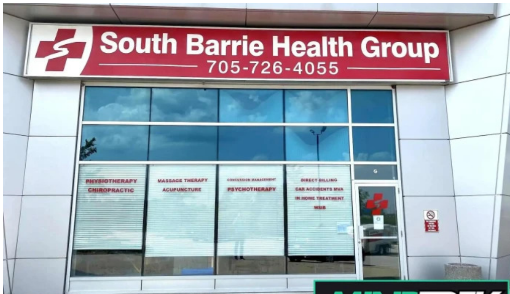
South barrie health group all