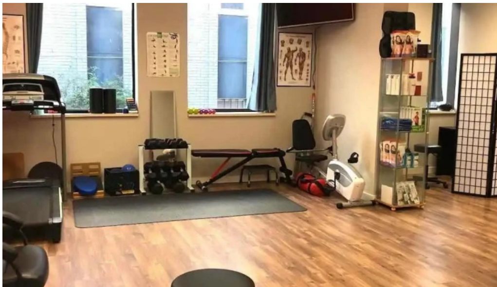
Physiohouse belleville physiotherapy massage acupuncture belleville