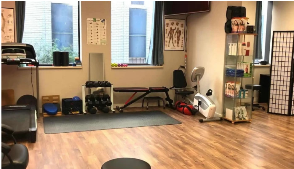
Physiohouse belleville physiotherapy massage acupuncture all