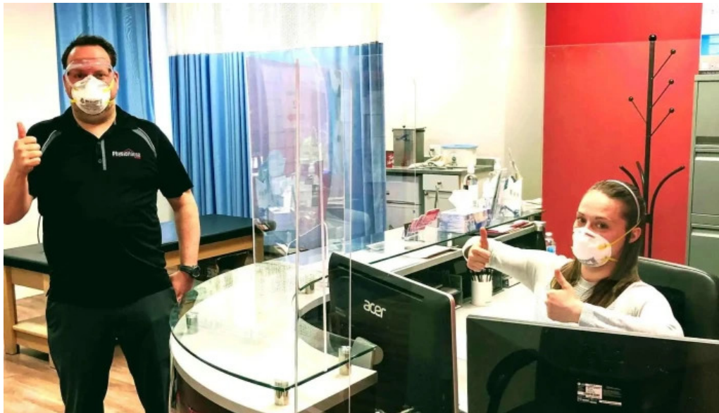
Physiohouse belleville physiotherapy massage acupuncture by owner