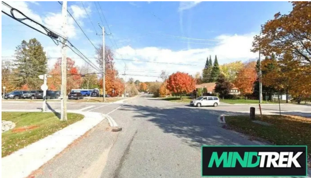
Miller health bracebridge