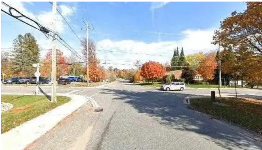
Miller health all