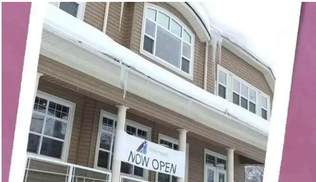
Miller health by owner