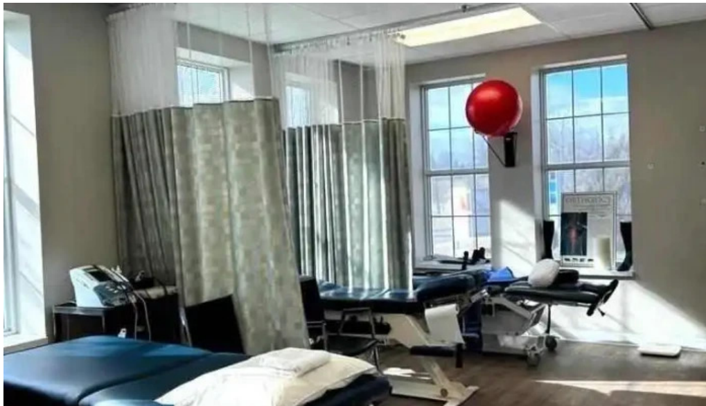
The cambridge physiotherapy cambridge