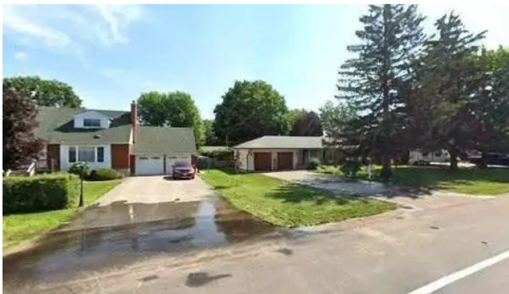
Dorchester physiotherapy all