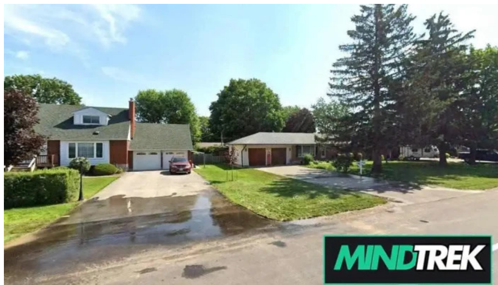
Dorchester physiotherapy dorchester