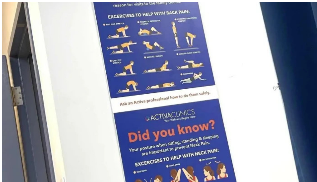
Activa clinics hamilton latest