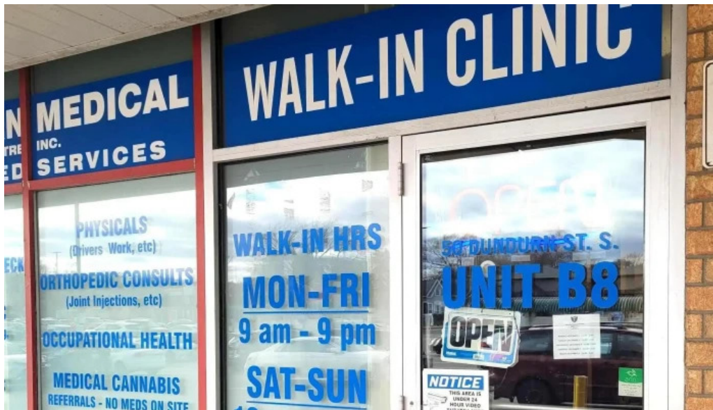
Activa clinics hamilton physical therapist