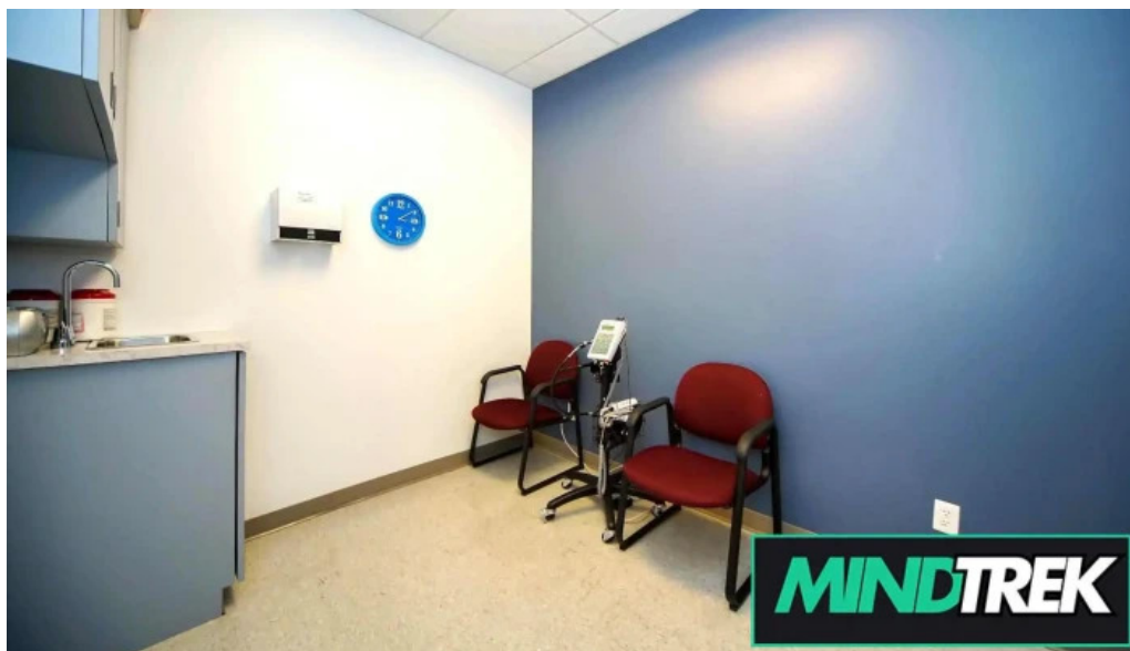
Activa clinics hamilton by owner