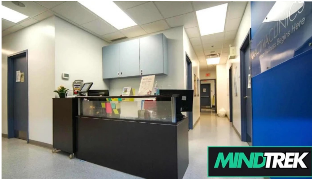
Acliva clinics hamilton all