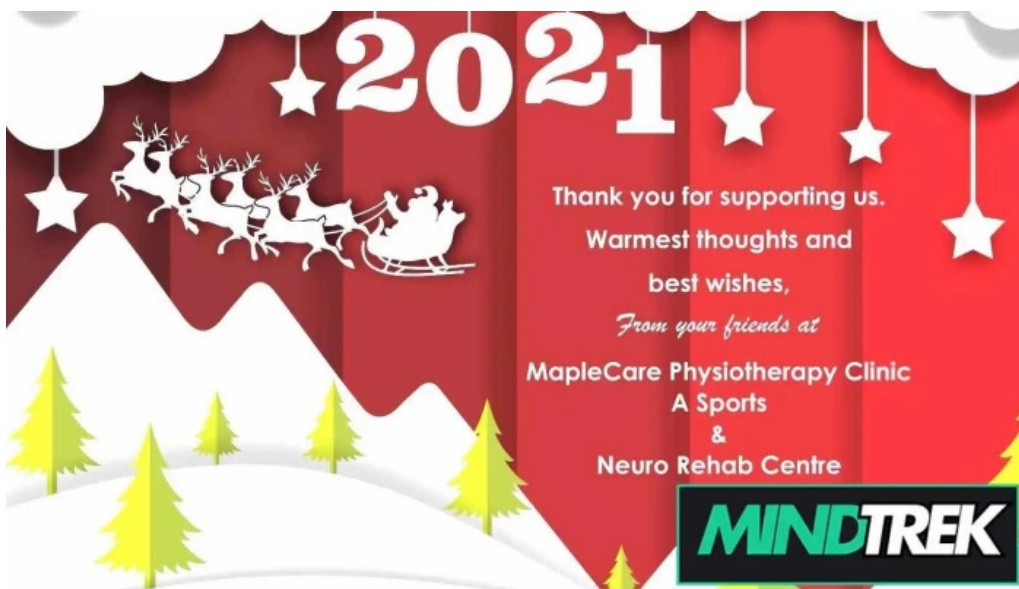
Maplecare physiotherapy clinic nepean