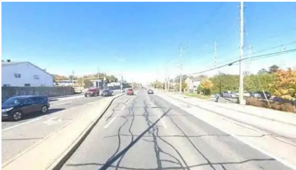
Maplecare physiotherapy clinic street view 360deg