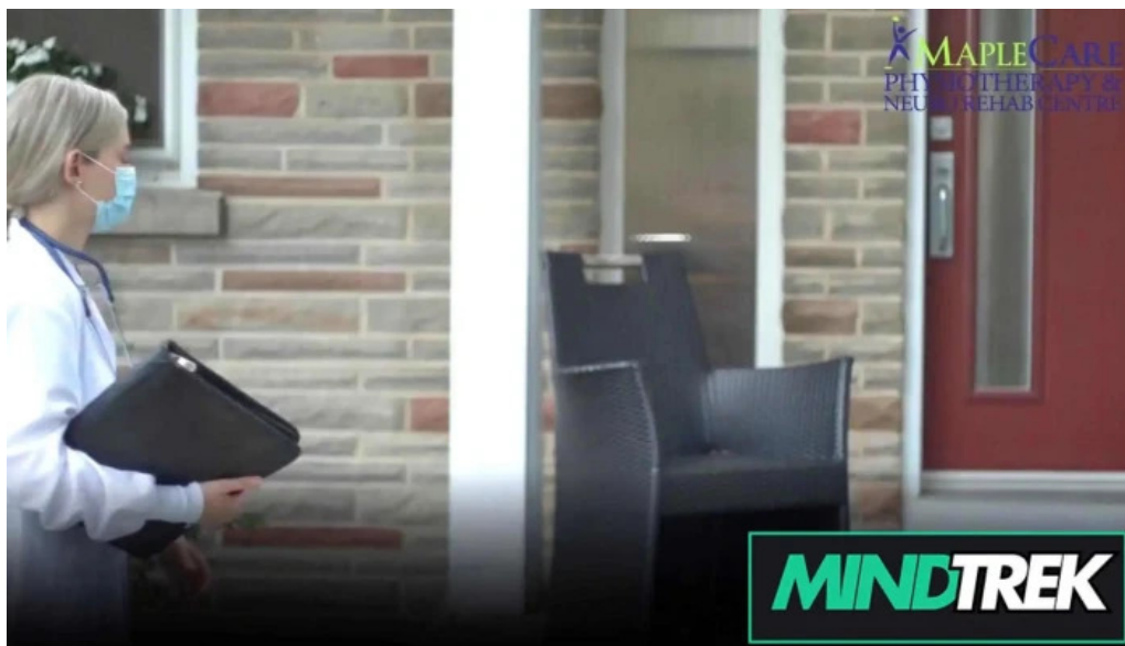
Maplecare physiotherapy clinic by owner