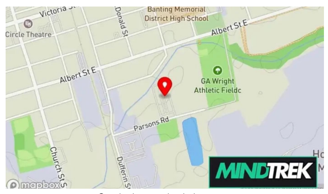
South simcoe physiotherapy map