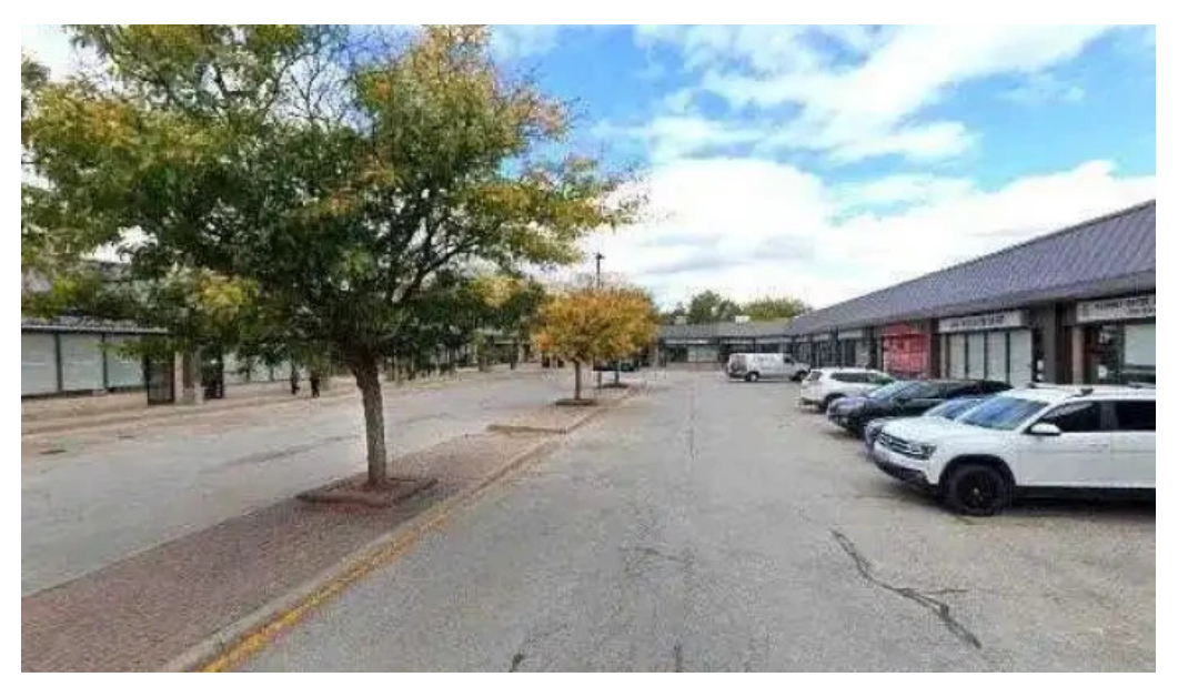
South simcoe physiotherapy street view 360deg