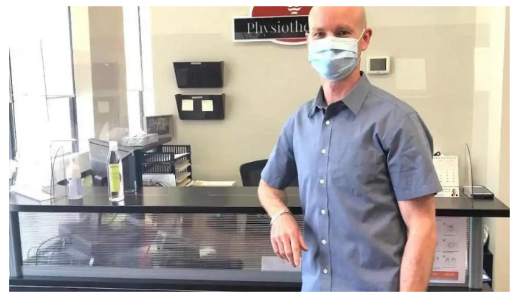
South simcoe physiotherapy new tecumseth