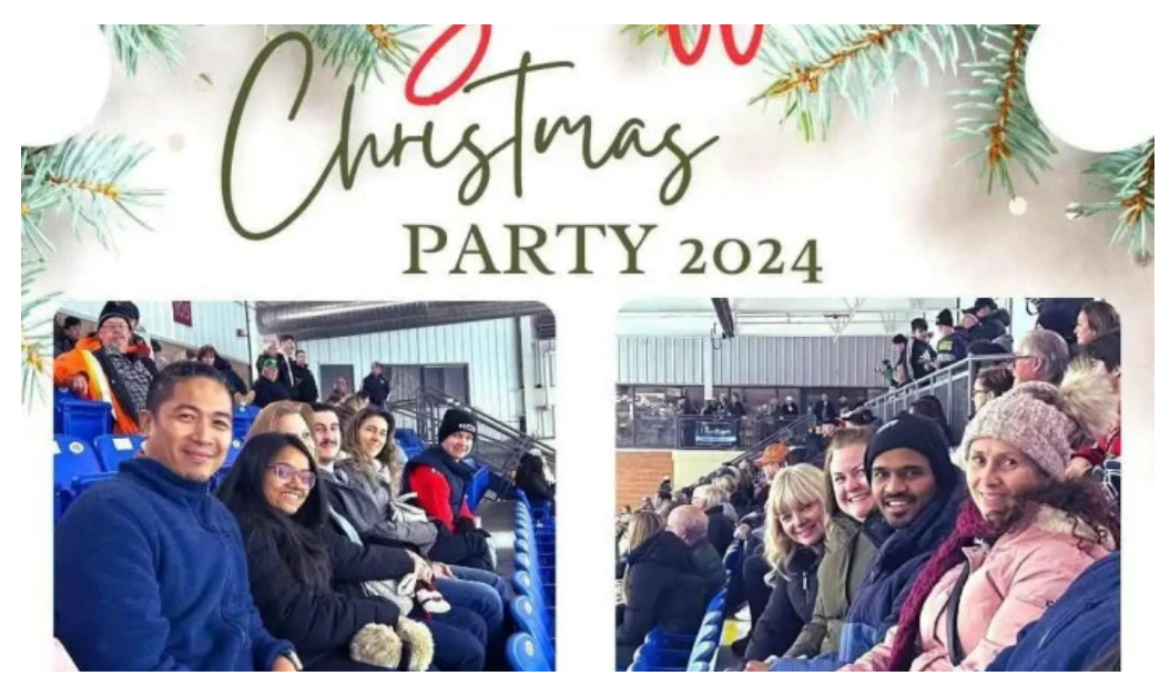
South simcoe physiotherapy latest