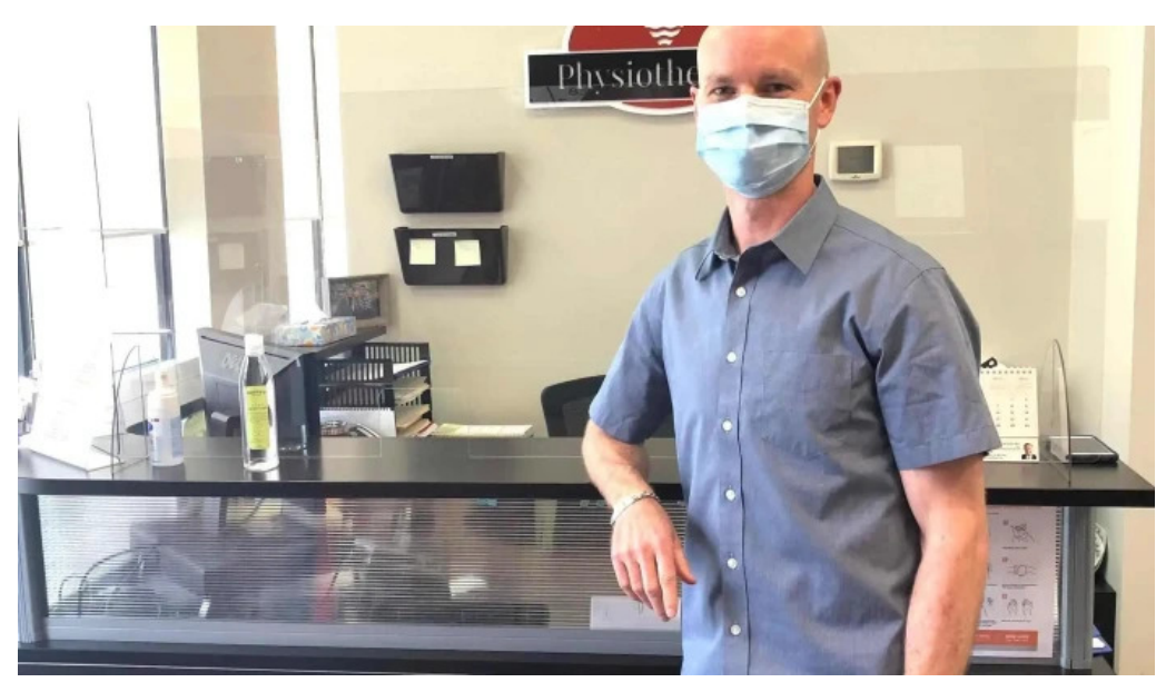
South simcoe physiotherapy all