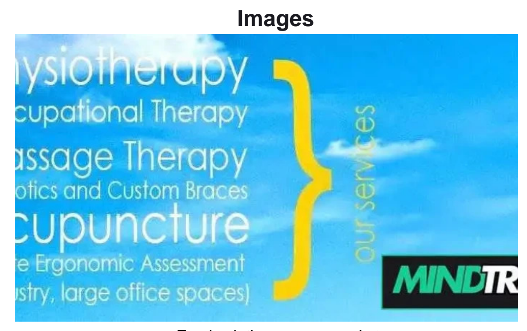
Eg physiotherapy newmarket

If you need to update any data that you think is incorrect about this web, please deliver a message so that we will correct it at the earliest convenience. Thank you in advance thanks.