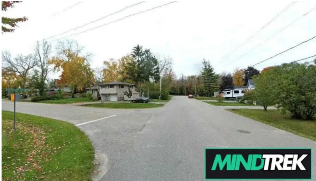
Thanasse physiotherapy consultants orillia