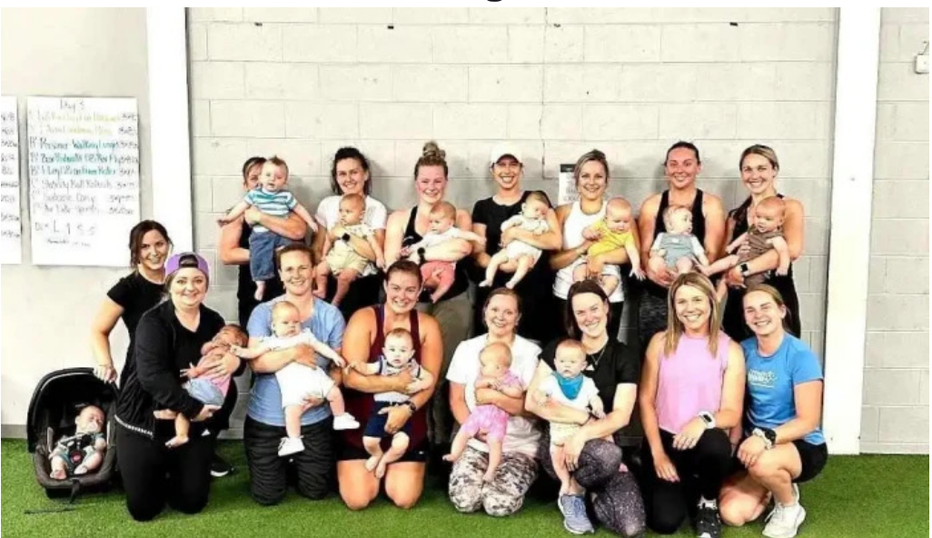
Peach physiotherapy wellness centre chatham