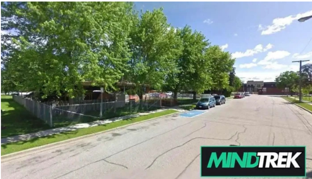
Cascade disability management dryden