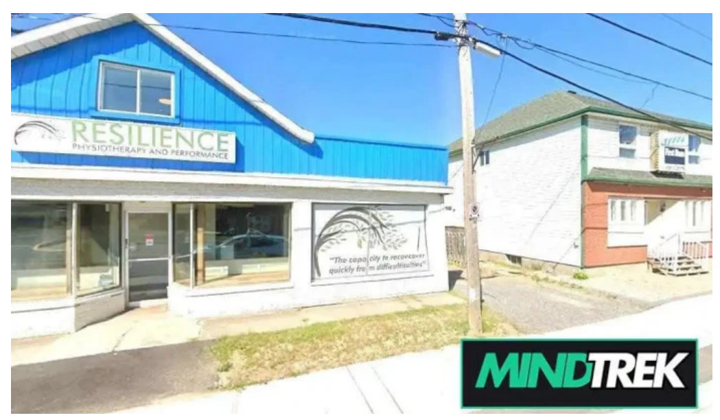
Resilience physiotherapy and performance espanola