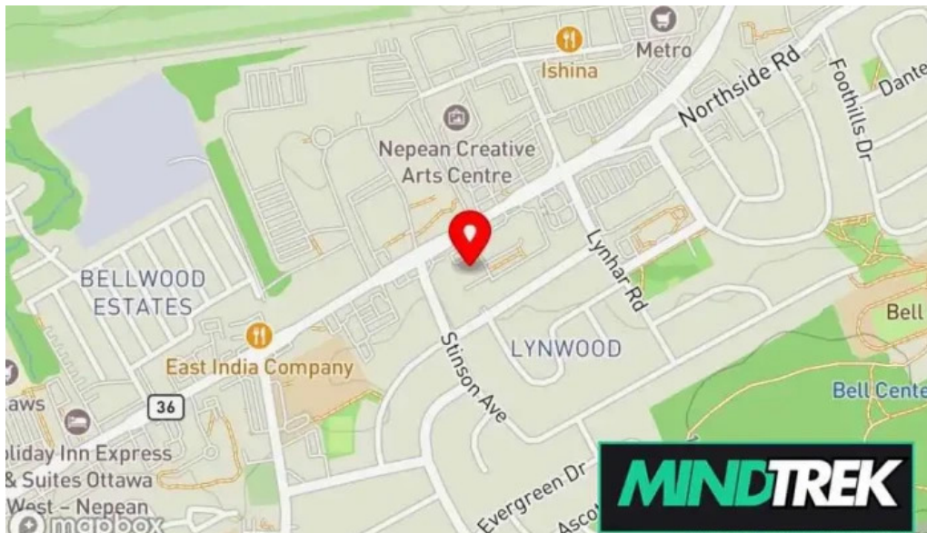
Breast rehab map