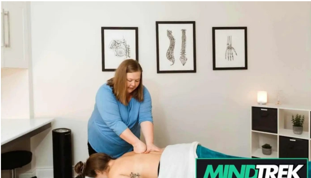
Breast rehab nepean