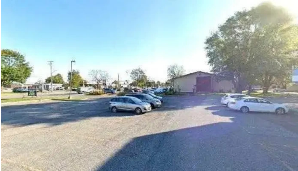
Breast rehab street view 360deg