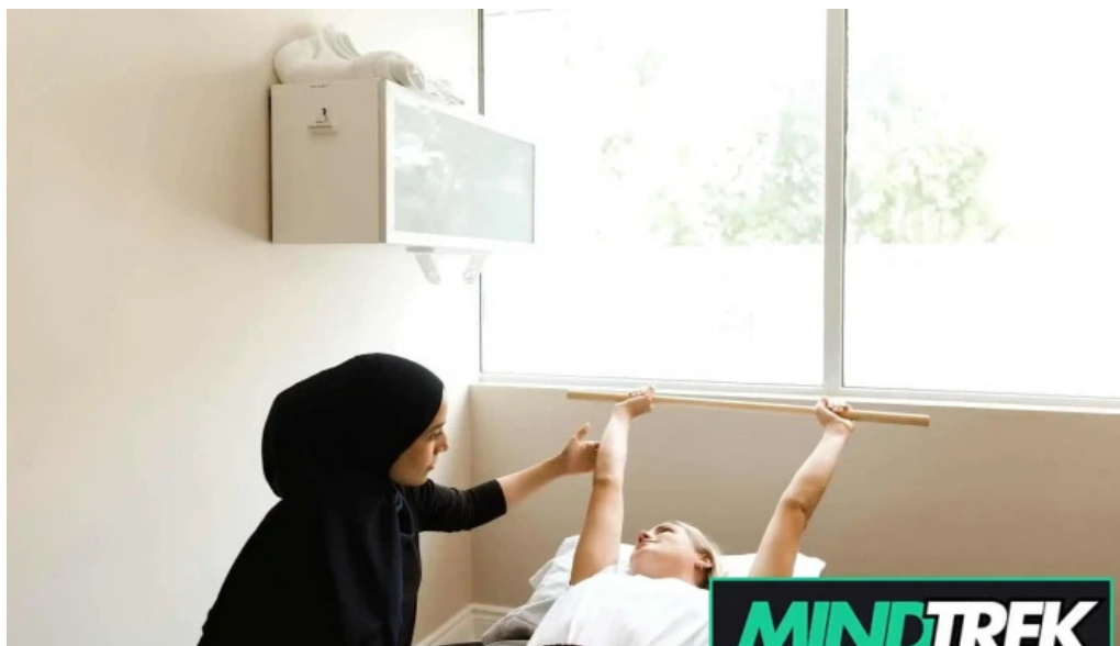
Breast rehab by owner