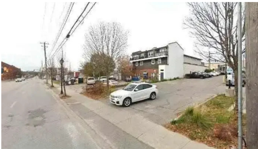
Mrodway norman mdfrpc all