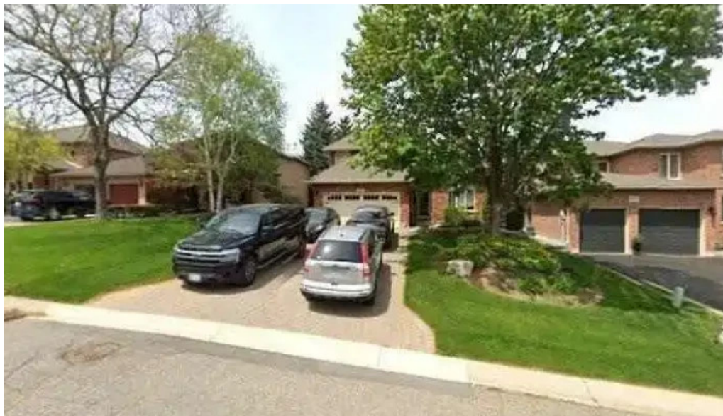
Aba compass behavior therapy services inc all