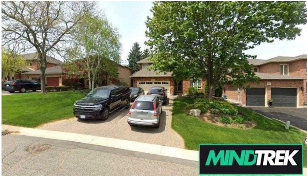
Aba compass behavior therapy services inc ancaster