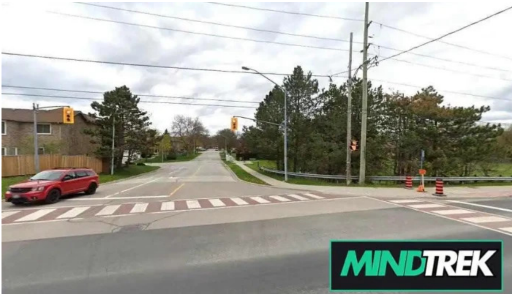
Dalton associates aurora