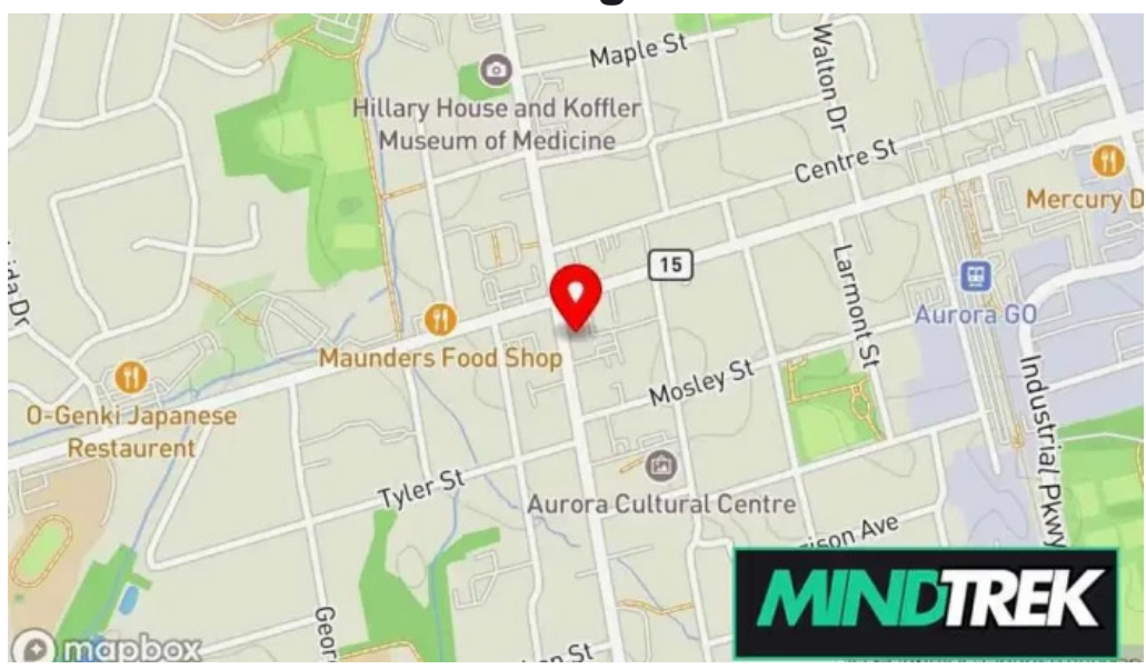
Samantha mcgrath map