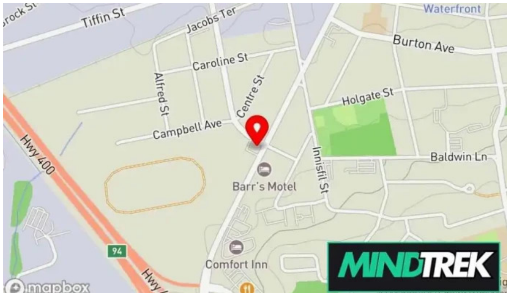
Central ontario psychology map