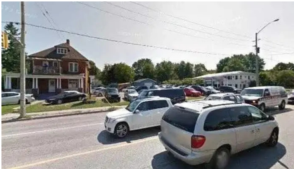
Central ontario psychology street view 360deg