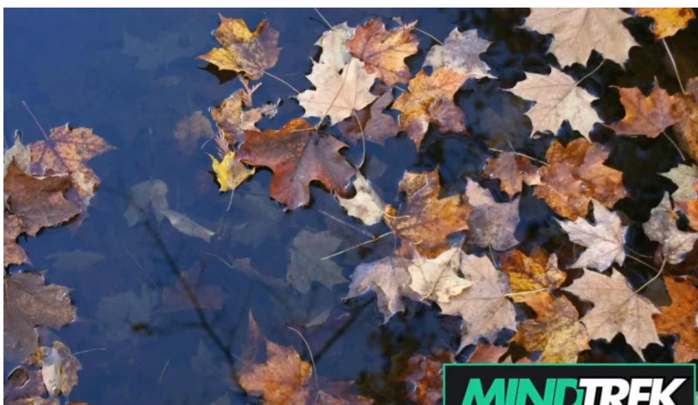
Central ontario psychology all