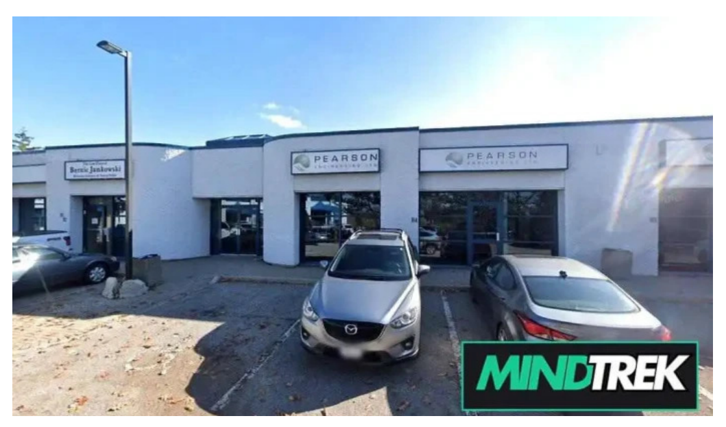
Dalton associates barrie