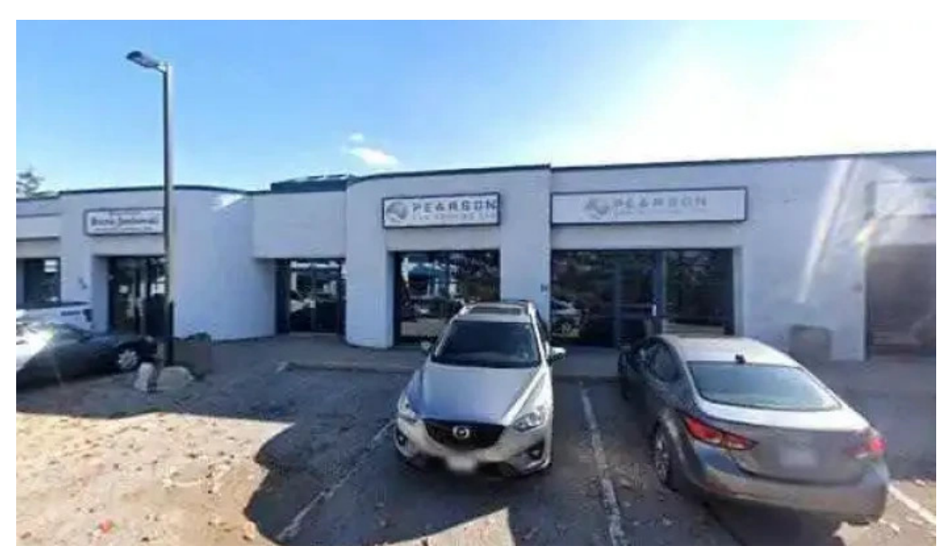
Dalton associates all