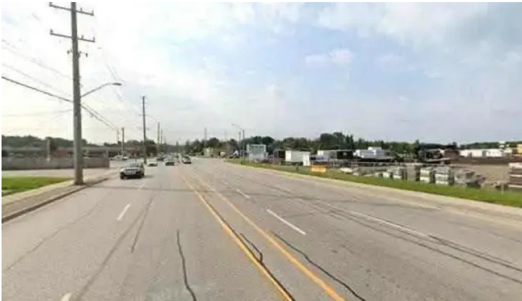
Marshall peter dr street view 360deg