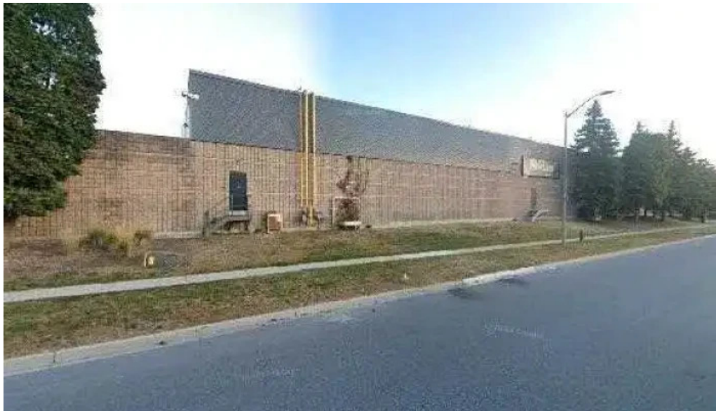
Psychology matters street view 360deg