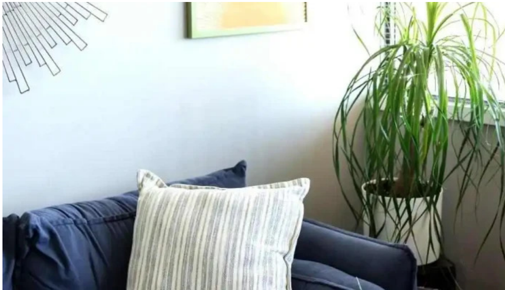
Psychology matters by owner