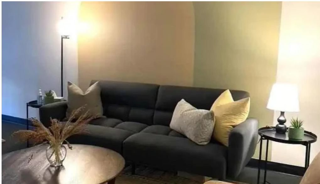
Kinpsych psychology centre belleville