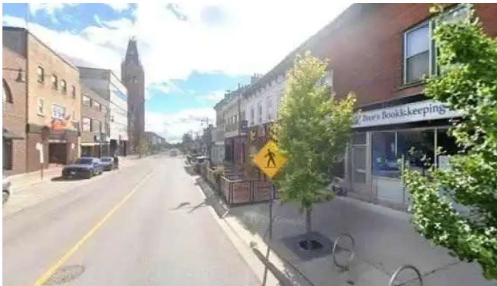
Kinpsych psychology centre street view 360deg