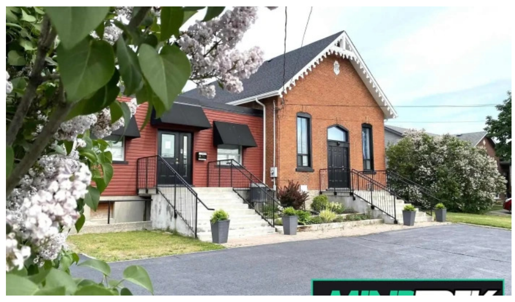
Moss psychology psychologist services by owner