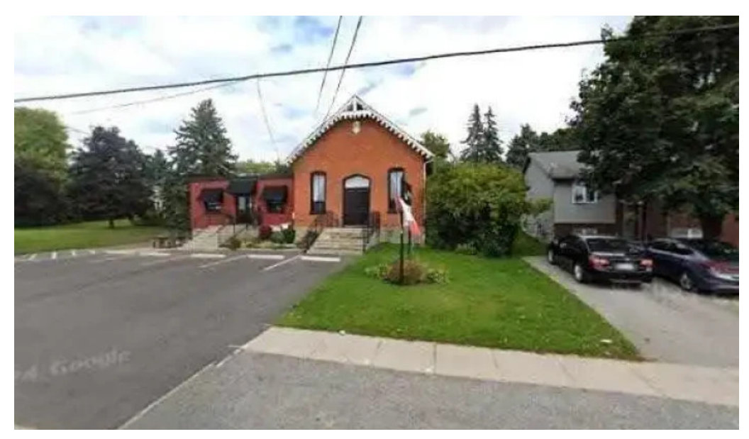
Moss psychology psychologist services street view 360deg