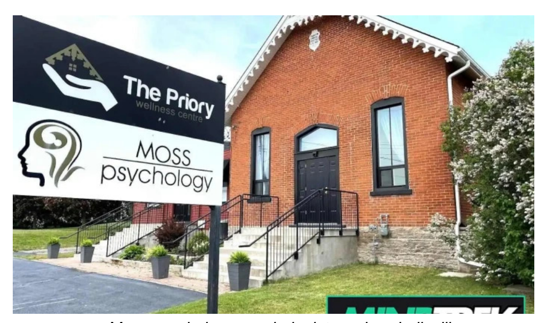
Moss psychology psychologist services belleville