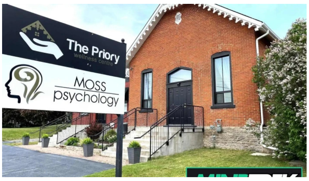
Moss psychology psychologist services all