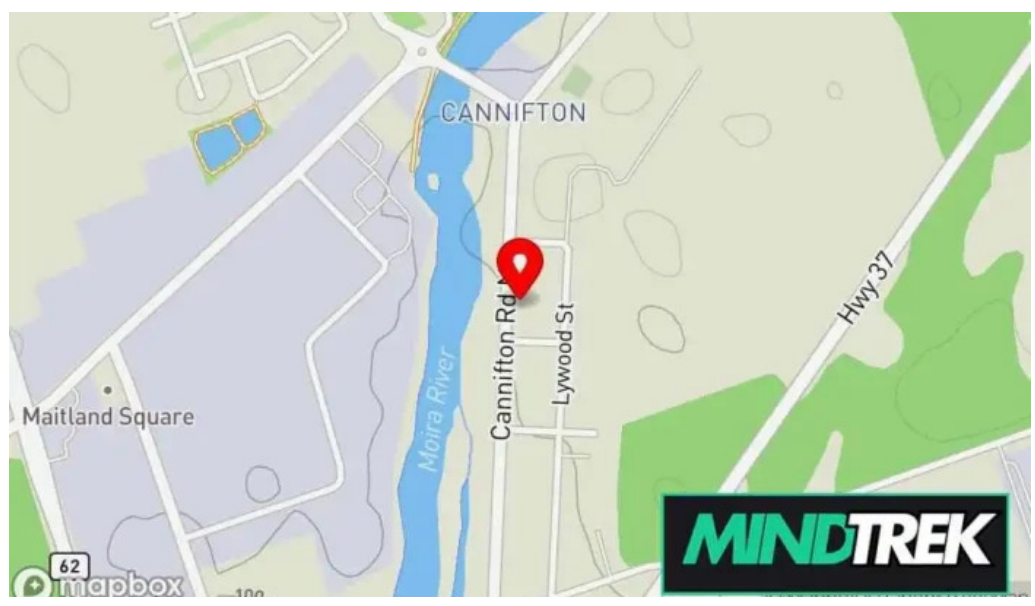
Moss psychology psychologist services map