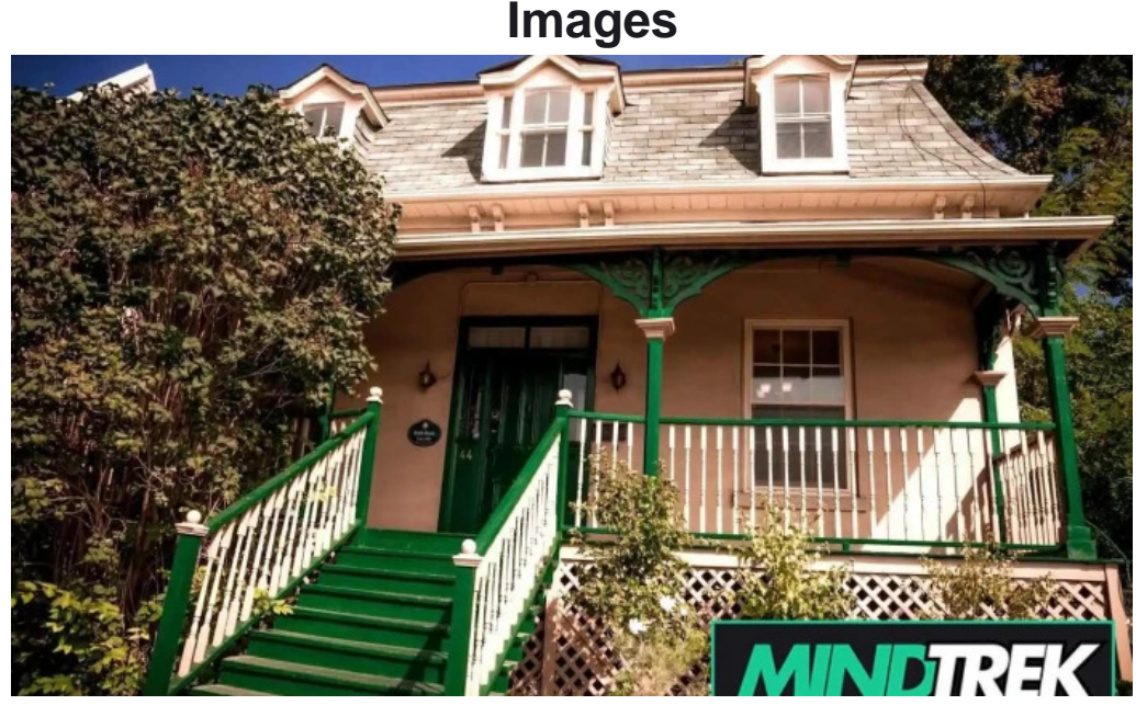
Eastwood psychologists brampton

If you wish to adjust any detail that you consider is not correct regarding this portal, we kindly request forward a message and we will fix it promptly. Thank you in advance thank you very much.