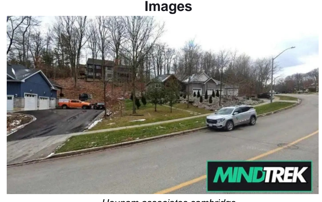
Hounam associates cambridge

If you wish to alter any element that you feel is not correct regarding this site, please forward a message and we will correct it as soon as possible. With anticipation we appreciate it.