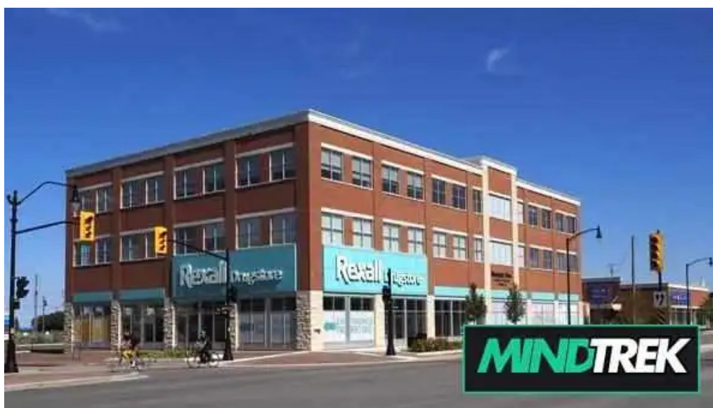
Peakminds psychological and assessment services collingwood