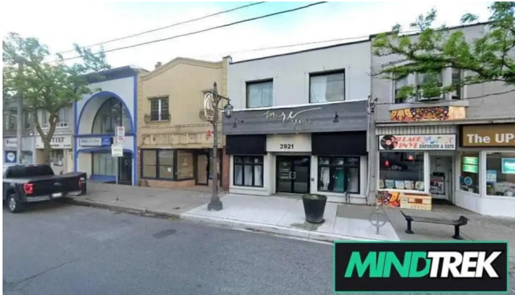
Dalton associates etobicoke