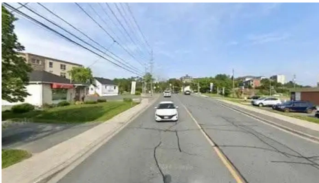
Alta psychology all