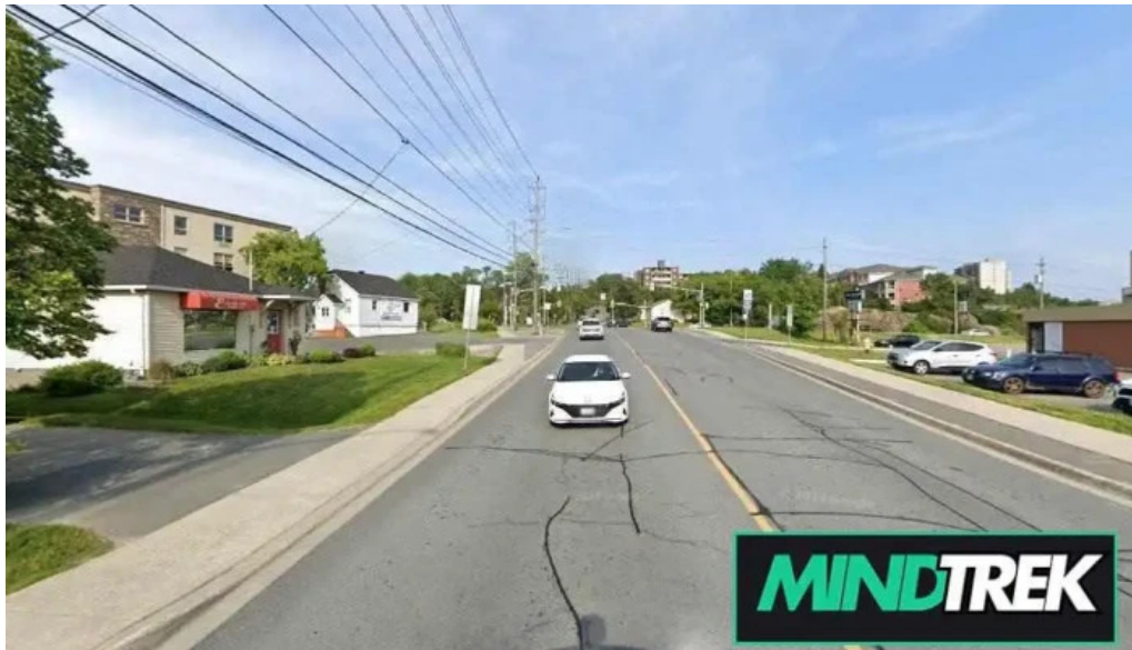
Alta psychology greater sudbury