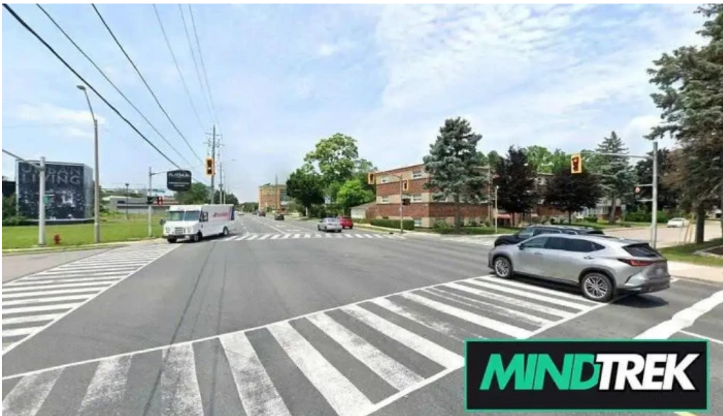
Kaplan levitt psychologists hamilton