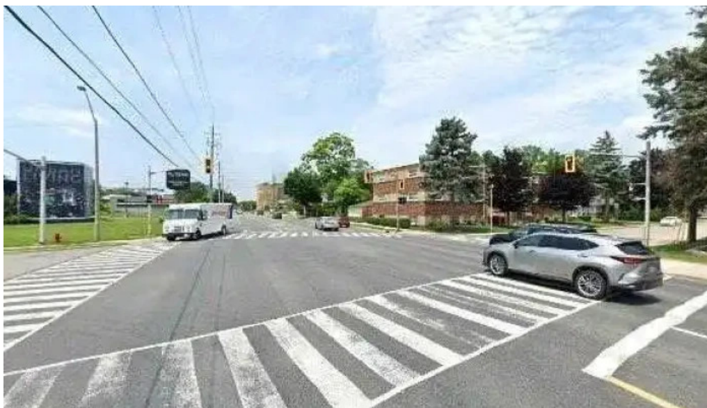
Kaplan levitt psychologists all