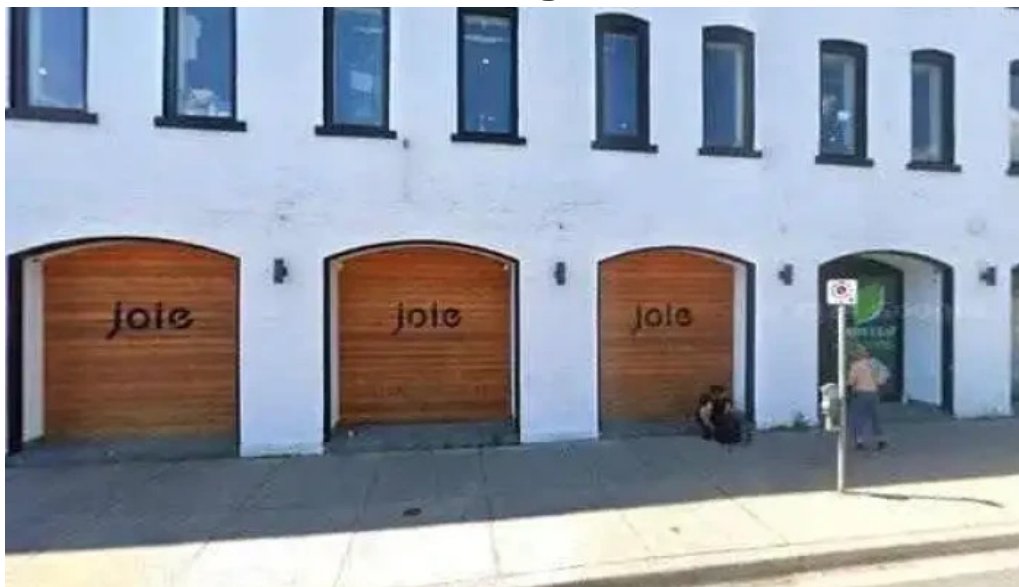
Ramsay and associates street view 360deg