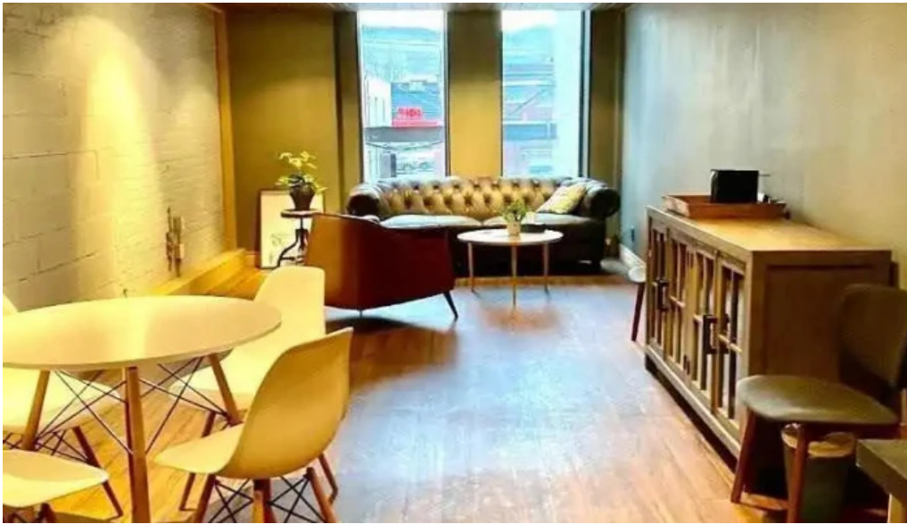
Ramsay and associates hamilton